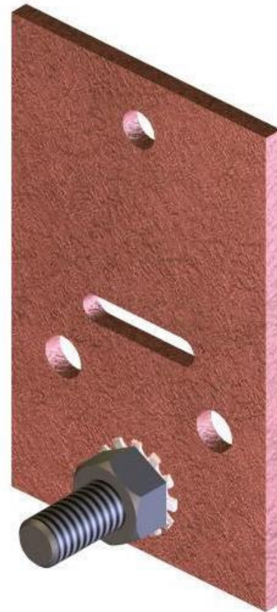
Figure 1: Single Pole Terminal Board with 5/16"-18x1" bolt and nut with integral lockwasher. Top hole size .25", bottom holes .28", and slot is .875"x.09".

Please contact your ECI Representative for price and availability of the Single Pole Terminal Board catalog number 7285ZAA2399.