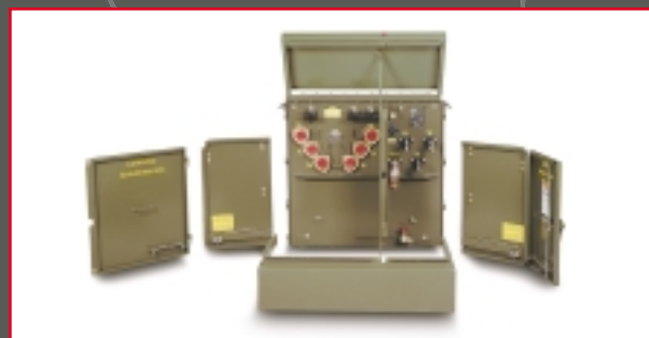
Unique Cabinet Design