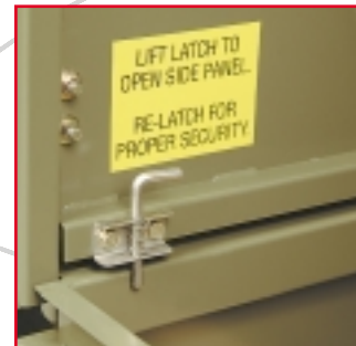
Side Wall Locking Device