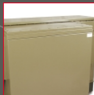
Removable Tank Cover