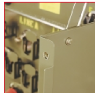
Rounded Metal Edges