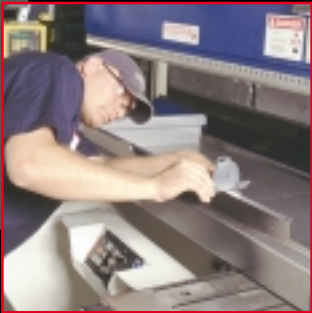
Precision Metal Fabrication