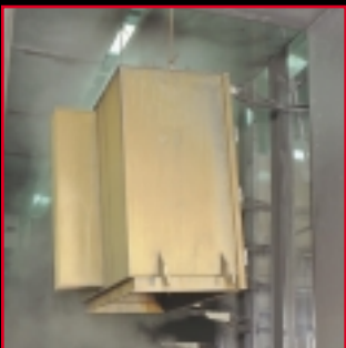
Powder Paint Application